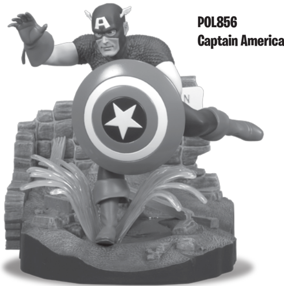
POL856 Captain America

For more information, visit round2models.com visit our blog at collectormodel.com